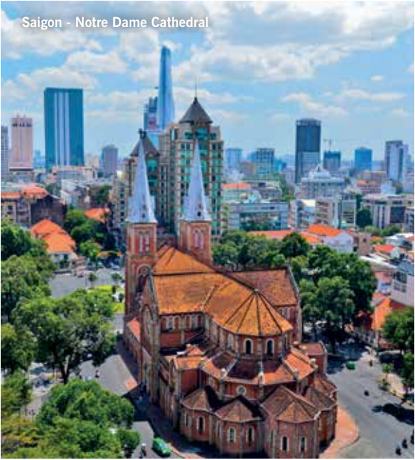
Saigon - Notre Dame Cathedral