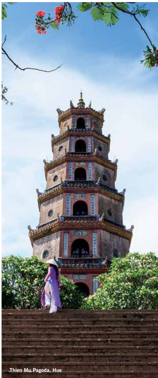
Thien Mu Pagoda, Hue