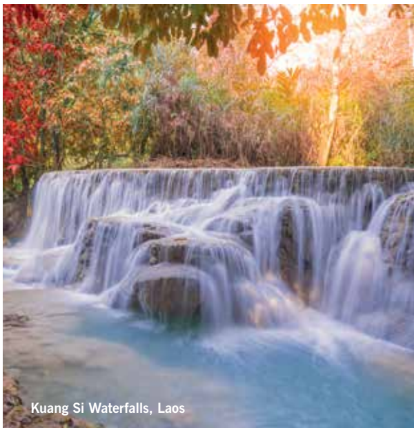
Kuang Si Waterfalls, Laos