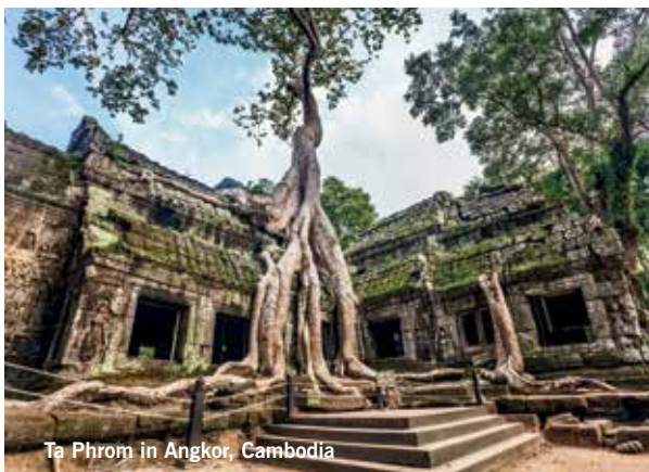
Ta Phrom in Angkor, Cambodia

We recommend you take cash in USD which can be exchanged at major (Thai) banks in Vientiane, or at upmarket hotels in Vientiane and Luang Prabang. It is easier and you will get a better conversion rate if you buy USD before leaving the UK.