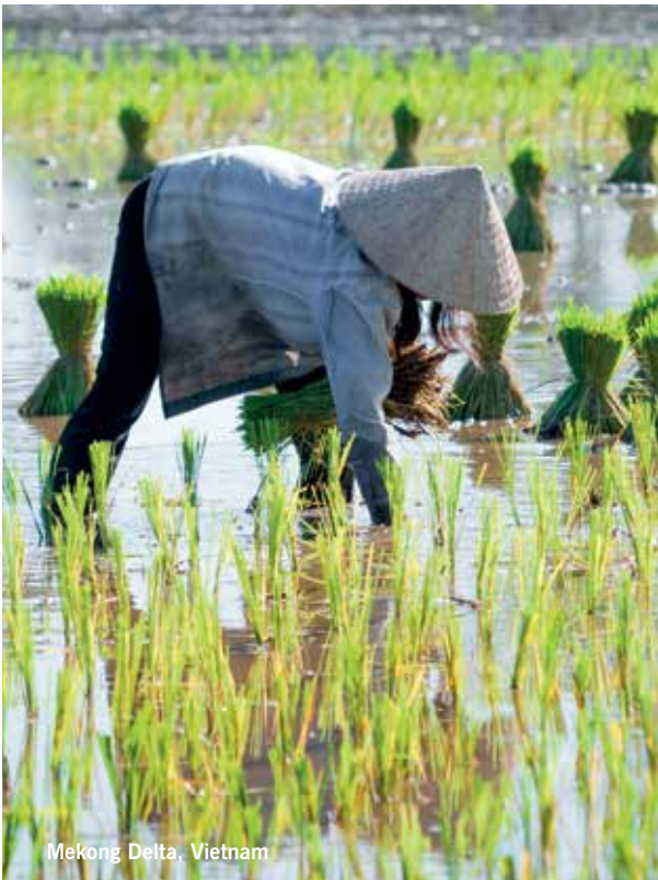
Mekong Delta, Vietnam

If you have booked a tour that does not include all meals, your local guides will be able to recommend a variety of restaurants to meet your taste and budget.