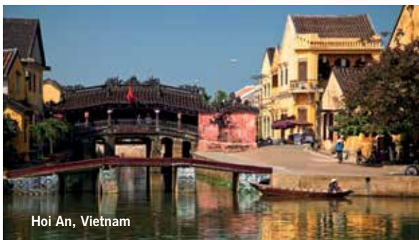
Hoi An, Vietnam

Counterfeit Cash: This is a problem in Southeast Asia so shop owners and clerks at banks or exchange desks are very cautious and can refuse to accept notes in bad condition. When purchasing cash in the UK or when exchanging them during your holiday – it is a good idea to stand at the desk to count and check the condition of each note. Do not accept any notes which are torn, very faded, a different shade, have ink stamps or any writing on them. If you accept the notes and sign the exchange receipt, then notice a problem, you will not be able to exchange them.