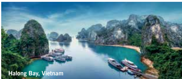
Halong Bay, Vietnam