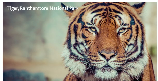
Tiger, Ranthamthore National Park

Our coaches are comfortable, air-conditioned vehicles. Please note that seatbelts are not compulsory by law and therefore the local people largely choose not to wear them. For this reason local operators may or may not have seatbelts hidden underneath protective seat covers. It is recommended that where seatbelts are available customers must use them and remain seated at all times whilst the vehicle is moving. Wendy Wu Tours cannot guarantee that vehicles will be fitted with operable seatbelts.